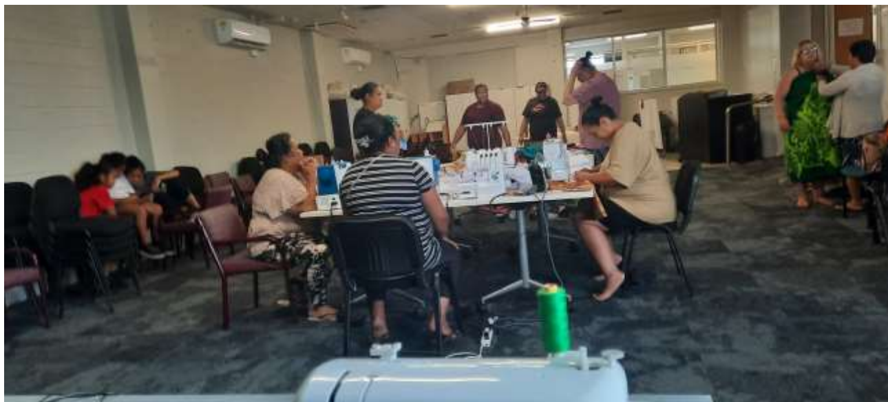
Pic 1. Te Whare Mahana Community Hub – Pasifika Sewing Programme, January 2022

As we have been building the Welcoming Communities plan, the Community Development Team has identified that a centralised hub for new comers to connect, create, participate and obtain information would be a valuable community resource. The team is working alongside Te Whare Mahana Community Hub in central Levin to create a purposeful place that will become an important home for Welcoming Communities activities and service provision. The hub could include health and wellbeing services operating on a hot desk basis, implementation of language and cultural programmes and workshops to build capability of local organisations.