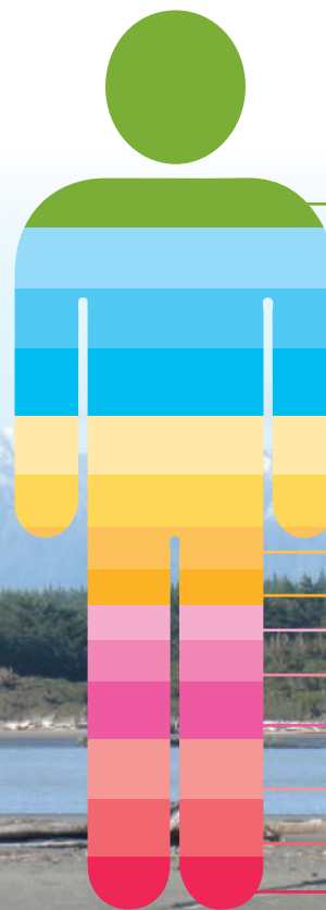
Horowhenua total population (2013)