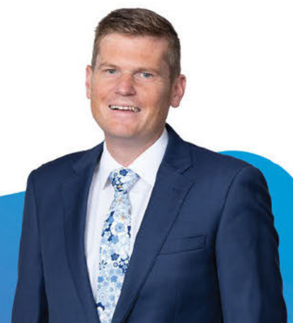
MP for Ōtaki